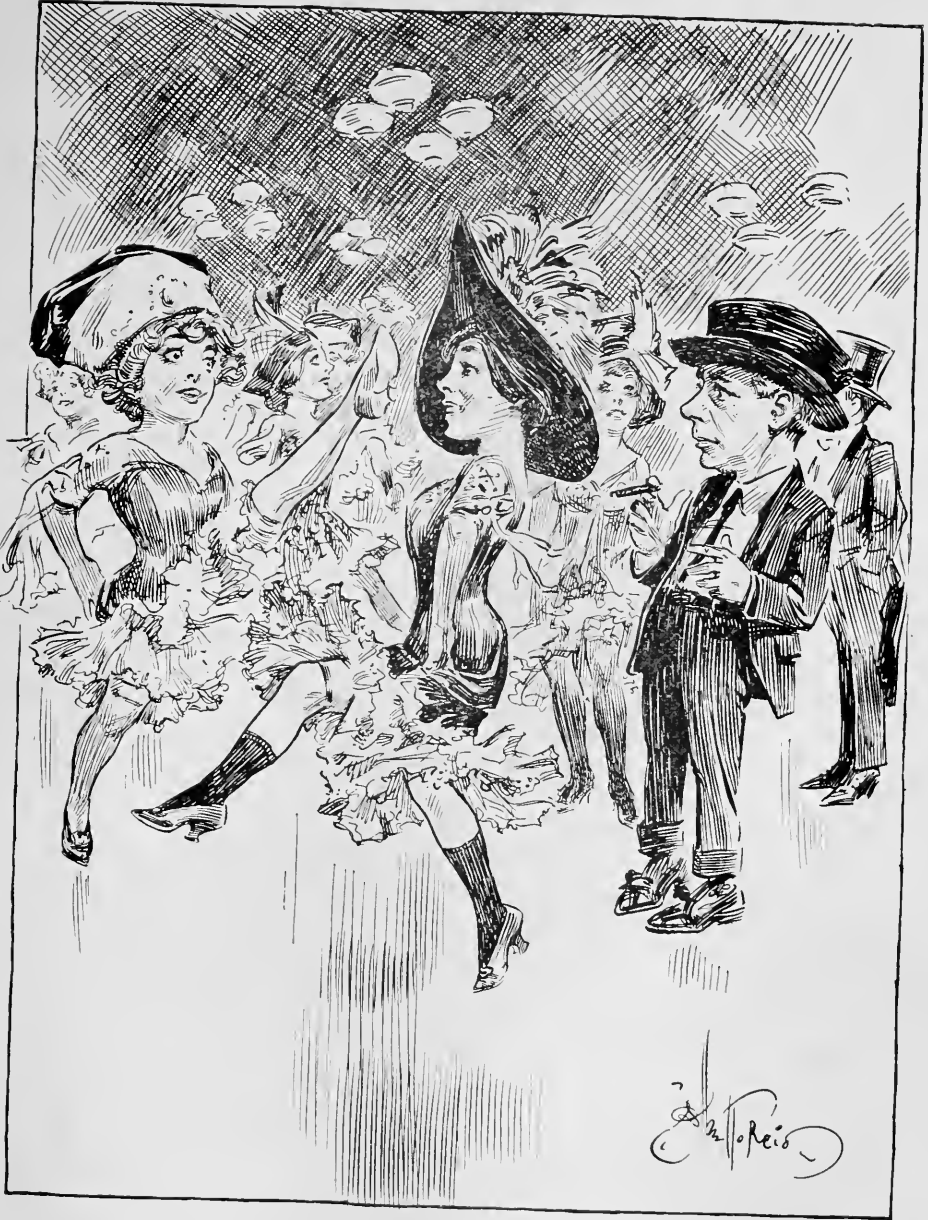
THE PLAIN QUADRILLE AT THE MOULIN ROUGE